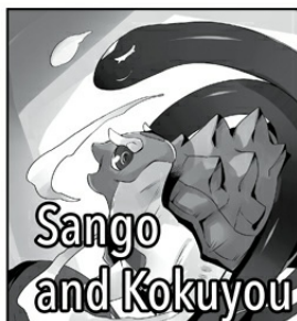
Sango and Kokuyou

The third of Touya's summoned Heavenly Beasts. She is the Flame Monarch, ruler of feathered things. Though her appearance is flashy and extravagant, she's actually quite cool and collected.